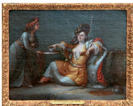
4. Top: Musavvir Hüseyin, '[Sultane avec ses serviteurs]' (1688 or earlier). Miniature painting in 'Costumes turcs de la cour et de la ville de Constantinople'.