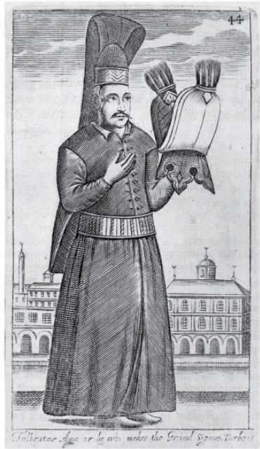
1. Left: Musavvir Hüseyin, 'Tulbend agasi: ou, Porte-turban' (1688 or earlier). Miniature painting in the album 'Costumes turcs de la cour et de la ville de Constantinople' (1720). Right: 'Tulbentar Aga: or, He Who Makes the Grand Signors Turban'. Engraving in Paul Rycaut, History of the Present State of the Ottoman Empire (first publ 1667; London, 1686), 44.