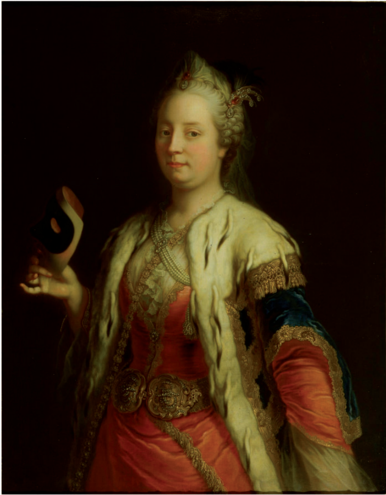
6. Martin van Meytens, Portrait of Maria Theresa in Turkish Dress and Mask (c. 1744). Oil on canvas.